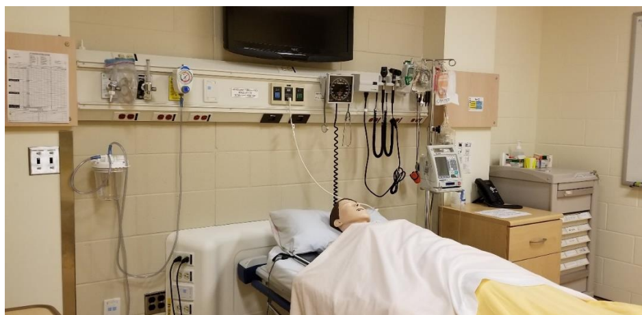
USB – Simulation room