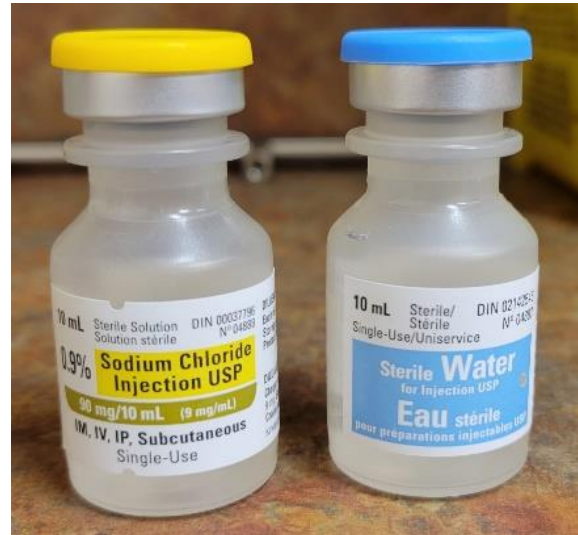
Sterile Solution Vials