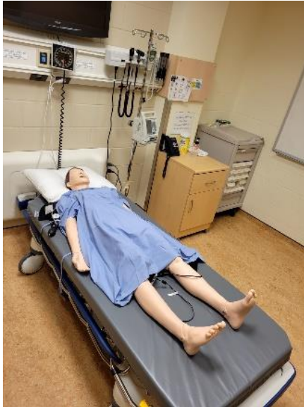
High-Fidelity Manikin (remotely programmable by assessor)