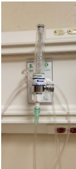
Wall Mounted Oxygen Regulator (functioning)