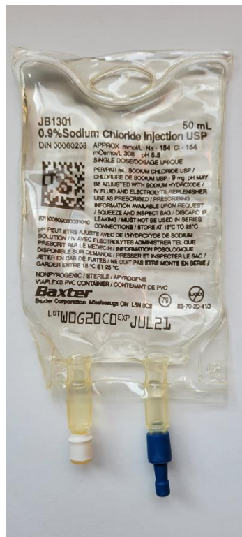
50 mL IV Mini-Bag