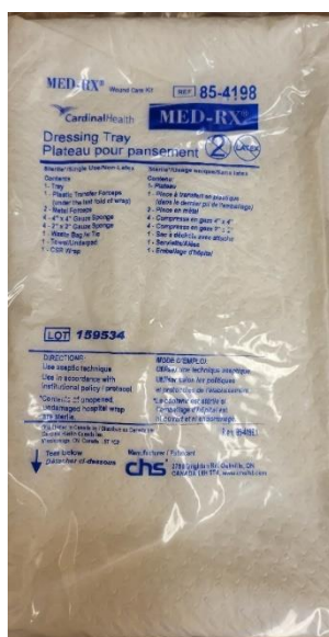
External Package of Sterile Dressing Tray