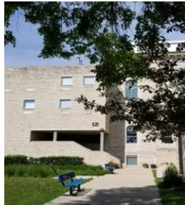
531 Aulneau Street entrance