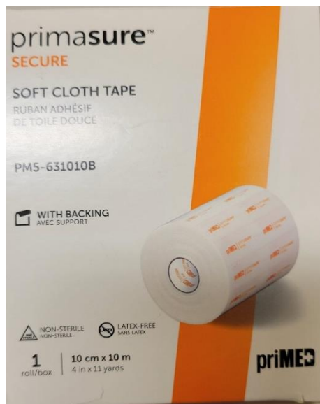
Prima Sure / Mefix Soft Cloth Tape