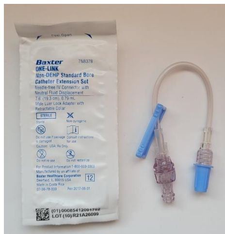
One Link Needless Catheter Extension Set