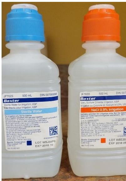
Sterile Solution Bottles