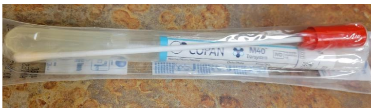
Sterile Culture & Sensitivity (C&S) Swab