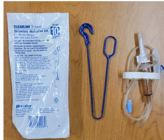
Clear Link System Secondary IV Tubing