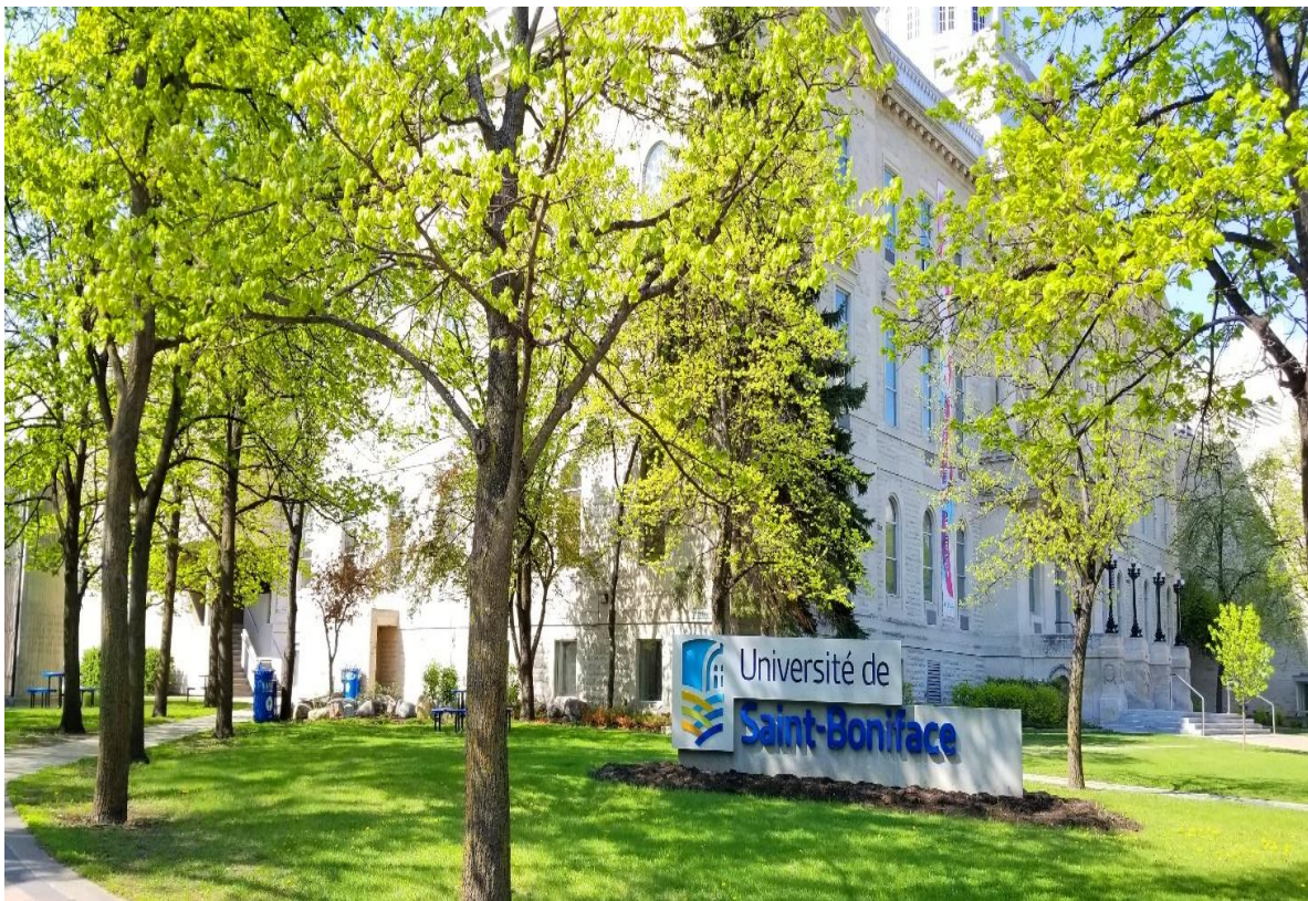
Université de Saint-Boniface (USB) - side and front entrance angle at Aulneau Street and Avenue de la Cathédrale