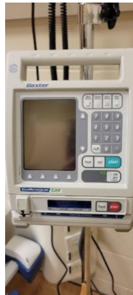
Single Channel Baxter Colleague IV Pump