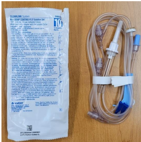
Clear Link System Primary IV Tubing