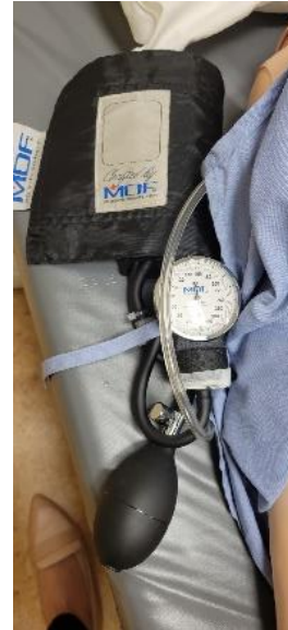
Manual BP Cuff (remotely programmable by assessor)