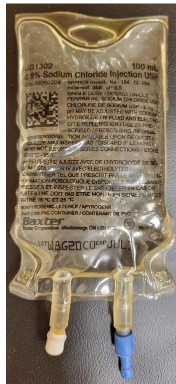
100 mL IV Mini-Bag