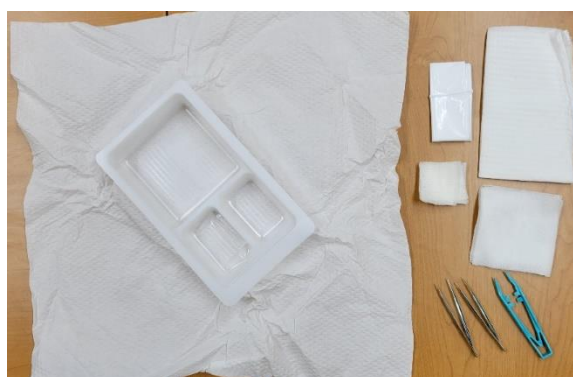
Internal Contents of Sterile Dressing Tray